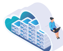
24/7/365 Tech Support

eFax, part of J2 Global ® , Inc., is a hosted Cloud Fax service used by millions of corporate customers worldwide — including thousands of UK companies and nearly half of the FTSE 100. The company's worldwide presence includes numerous offices in the U.S. and Canada as well as a European headquarters in Dublin, Ireland. A company with a nearly 20-year track record of significantly improving the fax infrastructure of organisations like yours, eFax: