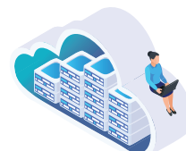
24/7/365 Tech Support

eFax, part of J2 Global®, Inc., is a hosted Cloud Fax service used by millions of corporate customers worldwide — including thousands of UK companies and nearly half of the FTSE 100. The company's worldwide presence includes numerous offices in the U.S. and Canada as well as a European headquarters in Dublin, Ireland. A company with a nearly 20-year track record of significantly improving the fax infrastructure of organisations like yours, eFax: